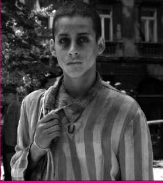
Thursday, July 20 9:00 pm The Little Theatre #1