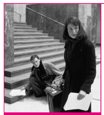
Saturday, July 22 7 pm & 10 pm Dryden Theatre