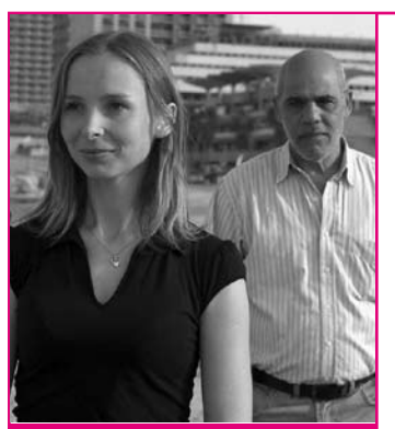
Wednesday, July 19 9:00 pm The Little Theatre #1