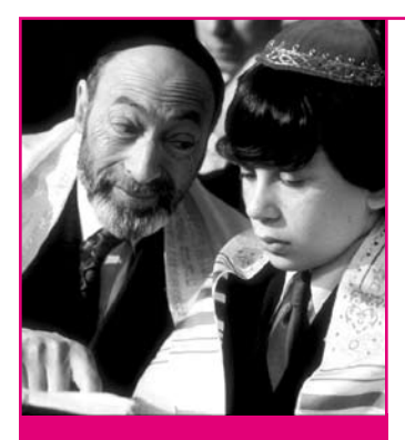
Sunday, July 23 4:00 pm The Little Theatre #1