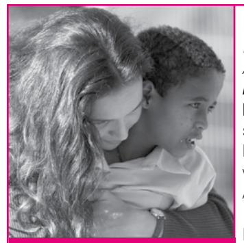
Sunday, July 16 3:00 pm The Little Theatre #1