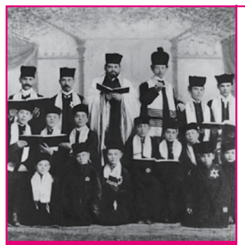
Sunday, July 16 7:00 pm The Little Theatre #1