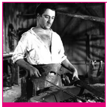
Thursday, July 20 2:00 pm Dryden Theatre