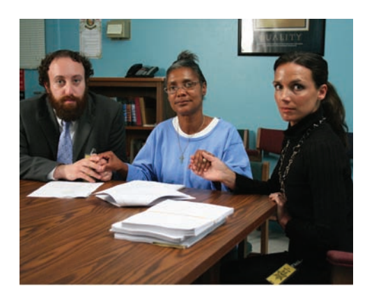
Justice, justice shall you pursue ... (Deuteronomy 16:18-20)