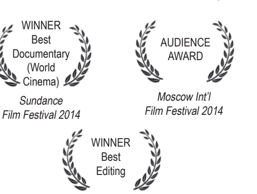
Docaviv Awards 2014

first-hand testimony, dramatic action sequences, and rare archival footage, decades of secrets come to light in this unflinching exploration of a profound spiritual transformation and the transcendent bonds of friendship.